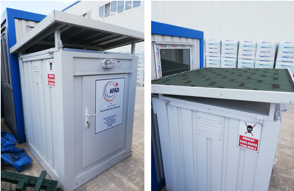
Figure 1. Photos showing seismic station cabinet, front view with entry door and side view